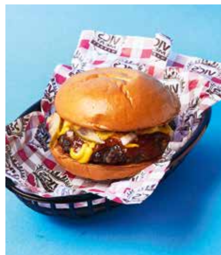
Wagyu Cheeseburger $14 Double $19 (smoked or grilled)