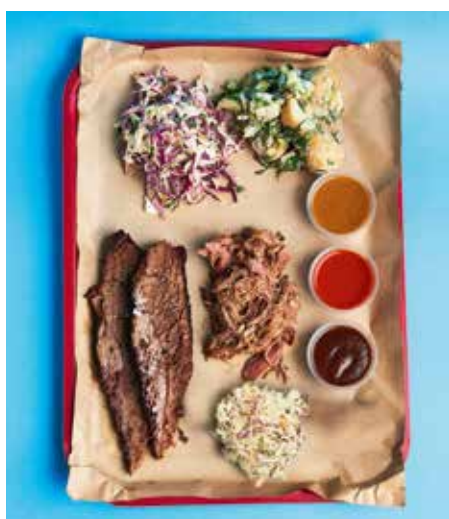
Meat Platter $39 (400g of meat)