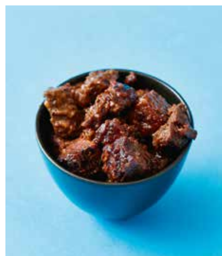
Burnt Ends $12