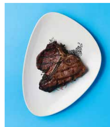
Pick your own steak $6 per 100g cook charge