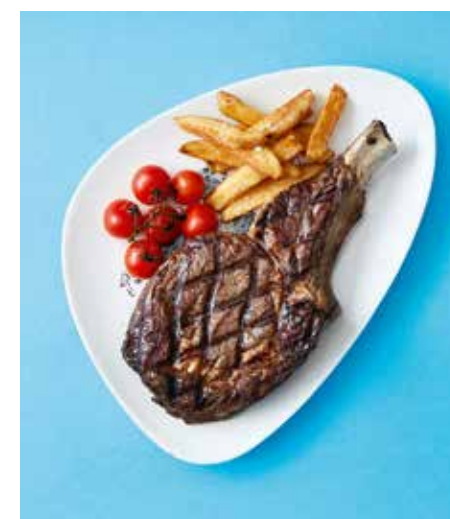
Steak with additional sides (see board for price)