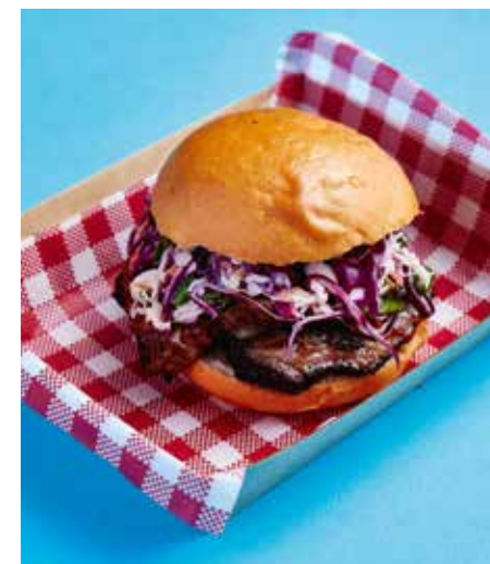
Brisket Burger $14