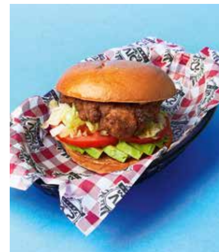
Fried Chicken Burger $14