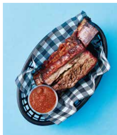
Beef Short Rib 100g $8 (min 300g)