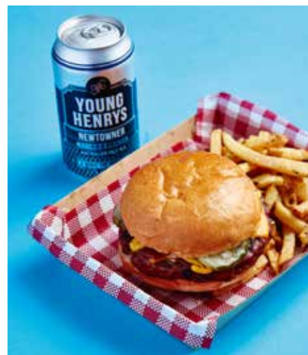
Burger Combo with beer $22