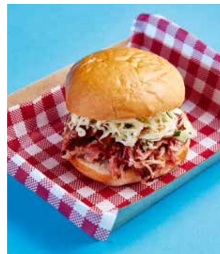
Pulled Pork Burger $14