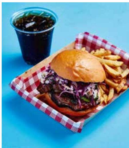
Burger Combo $20

Burger Combo: Burger / $6 Side / Soft drink or beer